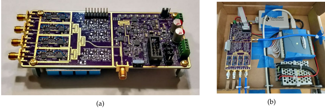
Figure 3: (a) Fully assembled radar PCB; (b) radar PCB integrated with power supply, DAQ, and TI USB2ANY programmer.